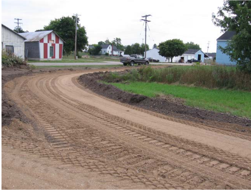
Gilson St. in Edmore – moving toward the Curtis Building First cuts and gravel on the curve onto Sheldon St.

As we approach the time period in which the Gratiot County portion of the Fred Meijer Heartland Trail is completed, the Friends will be in continued need of many Trail supporters. With a developed trail, volunteers are critical for regular maintenance including mowing, keeping the trail cleared of fallen trees and other debris, and maintaining weed control – to name a few. Watch for further trail updates as the Gratiot County Friends of the Fred Meijer Heartland Trail group will soon need to resume monthly meetings!