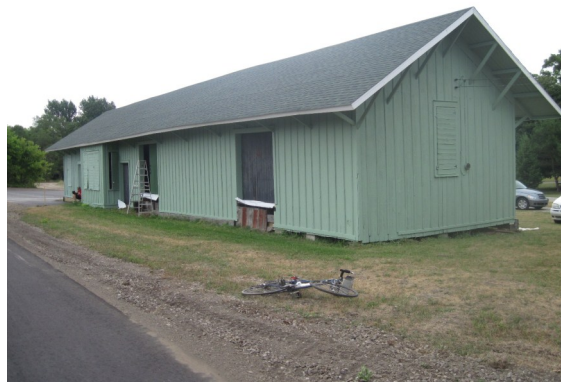
Vestaburg Depot After Painting