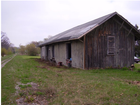
Vestaburg Depot Before Painting

The FFMHT hope to have more community events at the depot next summer. Suggestions for events are welcome.