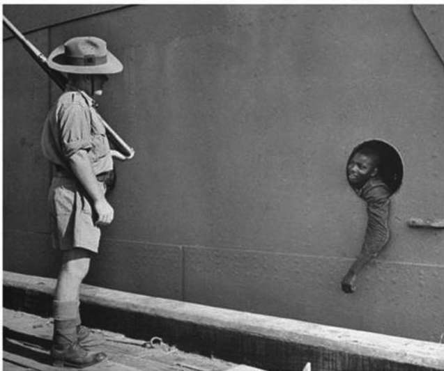
Good day, sir... This hole is too small for me to leave the boat. I cannot get to my bank, where I have stored eight point five million dollars... perhaps you can help me retrieve it?